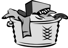
Smaller package, same value

You may have noticed something smaller in the laundry detergent aisle lately. A number of liquid laundry detergent containers are smaller than they used to be—but they still pack the same punch when it comes to cleaning clothes.