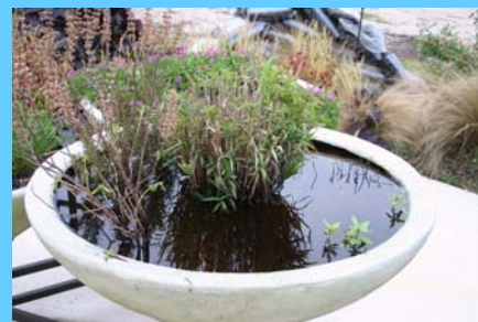
Discussion of drainage issues both above and below ground