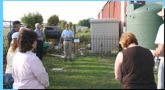
Water Harvesting 101