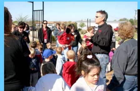
Teaching even the youngest generation assists in the use of our natural resources