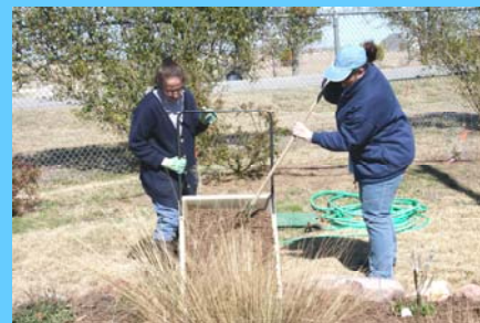
EarthKind™ techniques reduce water usage