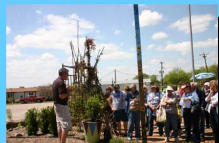
2010 Texas Master Gardener Association conference Post Tour to Rockwall County