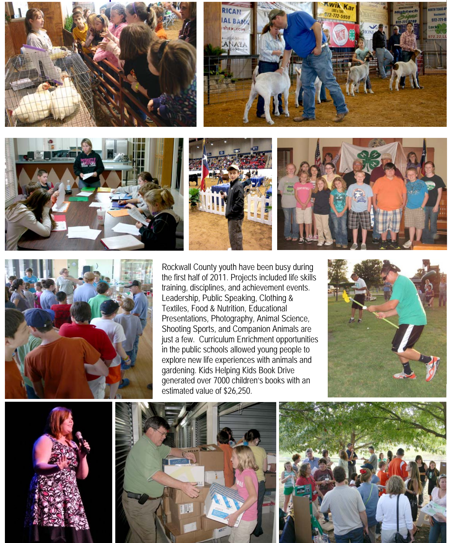
Rockwall County youth have been busy during the first half of 2011. Projects included life skills training, disciplines, and achievement events. Leadership, Public Speaking, Clothing & Textiles, Food & Nutrition, Educational Presentations, Photography, Animal Science, Shooting Sports, and Companion Animals are just a few. Curriculum Enrichment opportunities in the public schools allowed young people to explore new life experiences with animals and gardening. Kids Helping Kids Book Drive generated over 7000 children's books with an estimated value of $26,250.