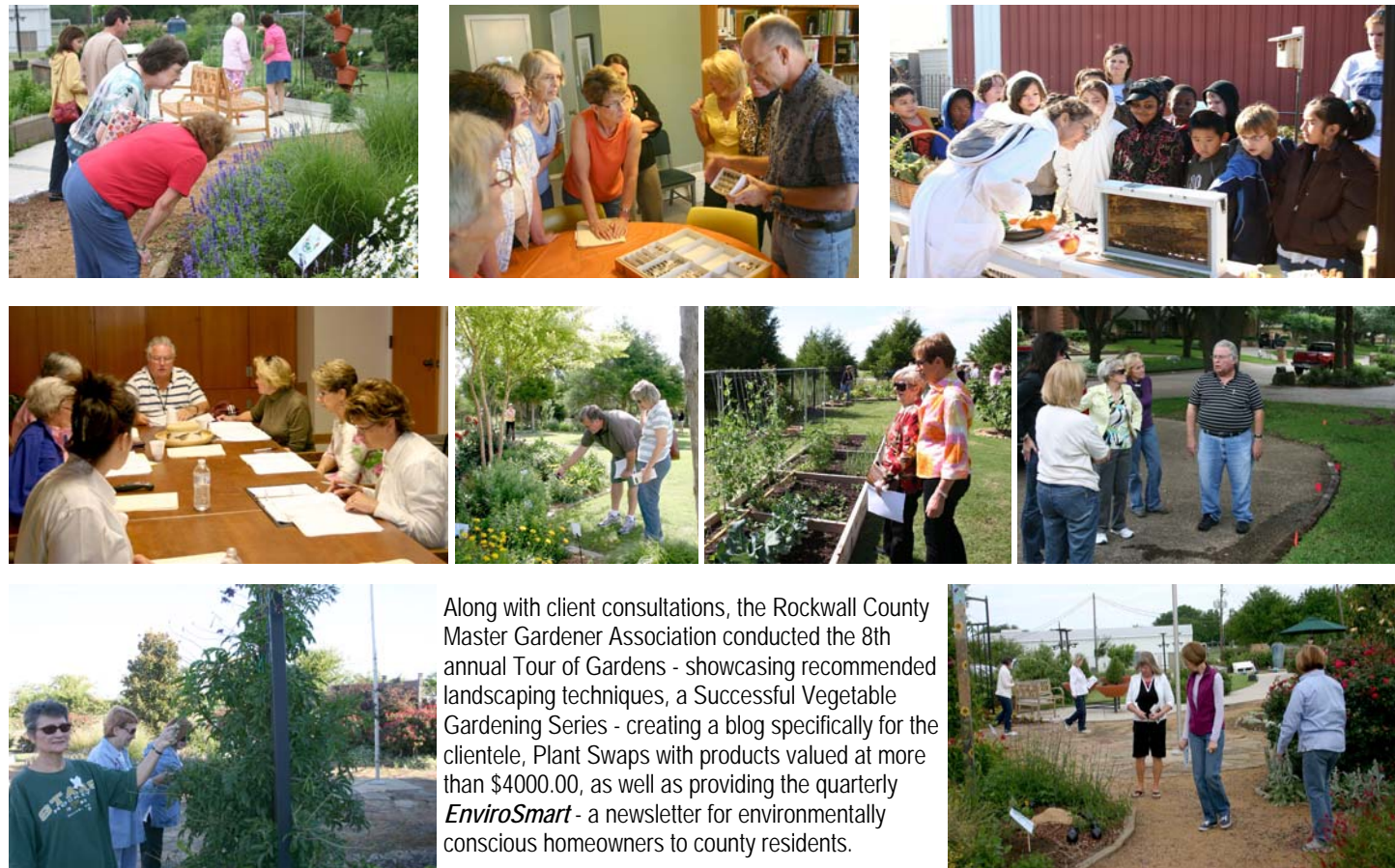
Along with client consultations, the Rockwall County Master Gardener Association conducted the 8th annual Tour of Gardens - showcasing recommended landscaping techniques, a Successful Vegetable Gardening Series - creating a blog specifically for the clientele, Plant Swaps with products valued at more than $4000.00, as well as providing the quarterly EnviroSmart - a newsletter for environmentally conscious homeowners to county residents.